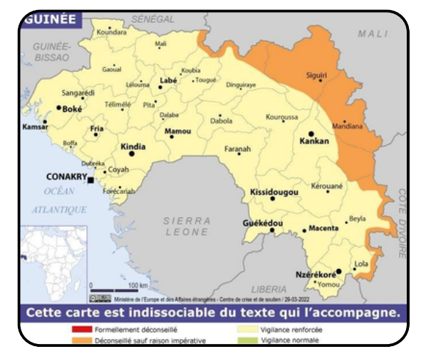
Map from the French Ministry of Europe and Foreign Affairs

The Republic of with Guinea, an estimated population of 14,448,353 in 2024. Its capital is in Conakry. The country is currently governed by a military junta. The National Transitional Council serves as parliament, and the President of the transition is Mamadi Doumbouya.